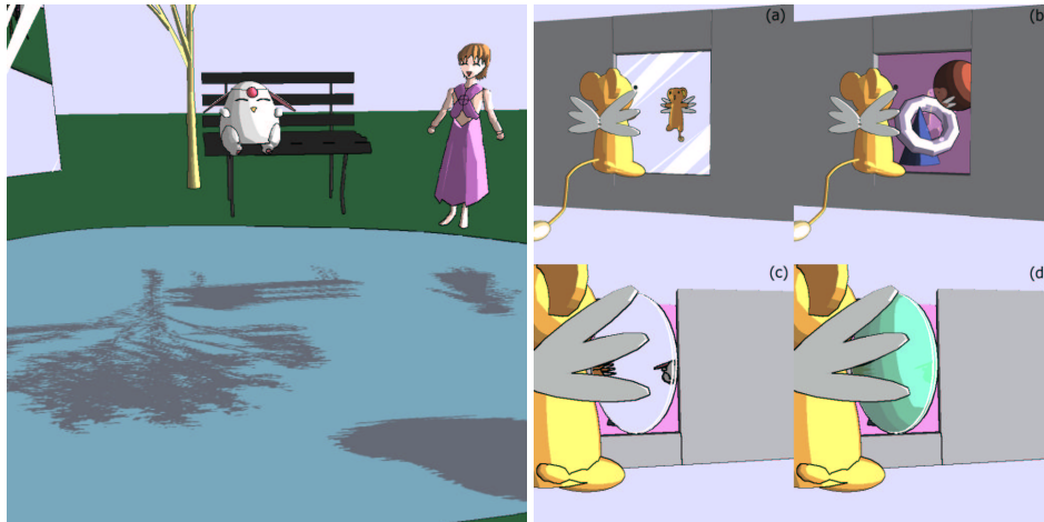
Abbildung 2: Different examples of reflecting and transmissive surfaces.